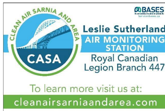
Figure 1. Sign Sample Template

There are three variable references on the sign: